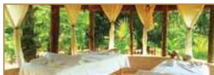
BATH & SPA ITEMS