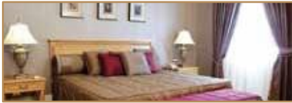
WINDOW BLINDS (SOLAR BLINDS, ROMAN BLINDS, VENETIAN BLINDS)