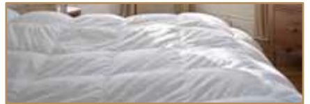
QUILTS (DUVETS, COMFORTERS) & PILLOWS