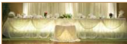
BANQUET & EVENT ORGANIZATION ITEMS