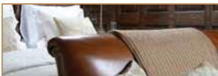
BLANKETS, COVERLETS & TROWS