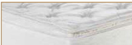
BEDS & PLATFORM BEDS