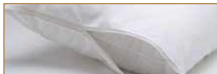
MATTRESS & PILLOW PROTECTORS