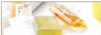
SUNDRY ITEMS FOR HOTEL ROOMS & SUITES