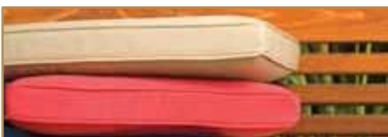
PATIO & POOL ITEMS