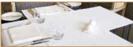
RUNNERS & PLACEMATS