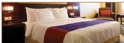
BED LINENS & PILLOW CASES