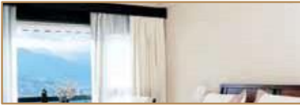
CINEMA, THEATRE, STAGE & PODIUM CURTAINS